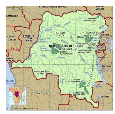
Figure 1: The map of DR Congo.

Monitoring forest and vegetation through remote sensing takes into account various considerations, techniques and processes. Satellite-based monitoring is often based on spectral calculations incorporating surface reflectance registered by sensors. The ESA's Sentinel-2 mission has found application in the monitoring of forest state and disturbances (Hoersch, 2013).